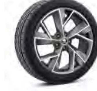
19" CURSA anthracite alloy wheels